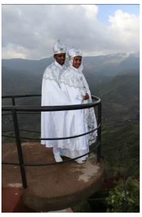
JULY 2016 WEDDING DAY