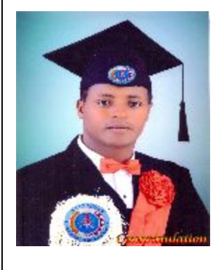
BSc. In Animal Science From Axum University