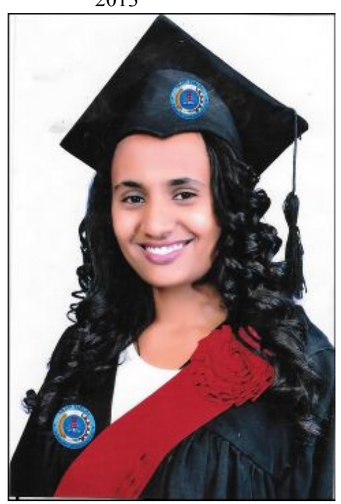
JULY 2016 BSc in Engineering